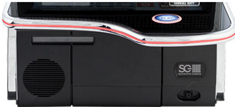
Scientific Games Anchorman Slots

Based on the beloved Paramount Pictures' comedy franchise, ANCHORMAN is a five-reel, 25-line video slot game that boasts a three-level Near-Area Progressive. The central game feature is the engaging Big Bonus Filmstrip Stop featuring Ron Burgundy and the rest of the comical Channel 4 News team. If the filmstrip stops on a character, a bonus game starring that character is triggered.